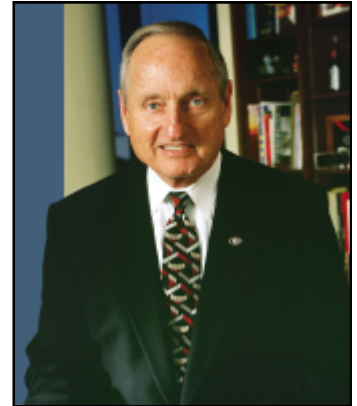
Coach Vince Dooley

We invite you to participate as a player and sponsor in the Georgia Bulldog Club of Jacksonville's 17th Annual Vince Dooley Scholarship Golf Tournament. Your support is critical to the tournament's success and allows us to fund four (4) scholarships totaling $12,000 every year for deserving students from the North Florida area.